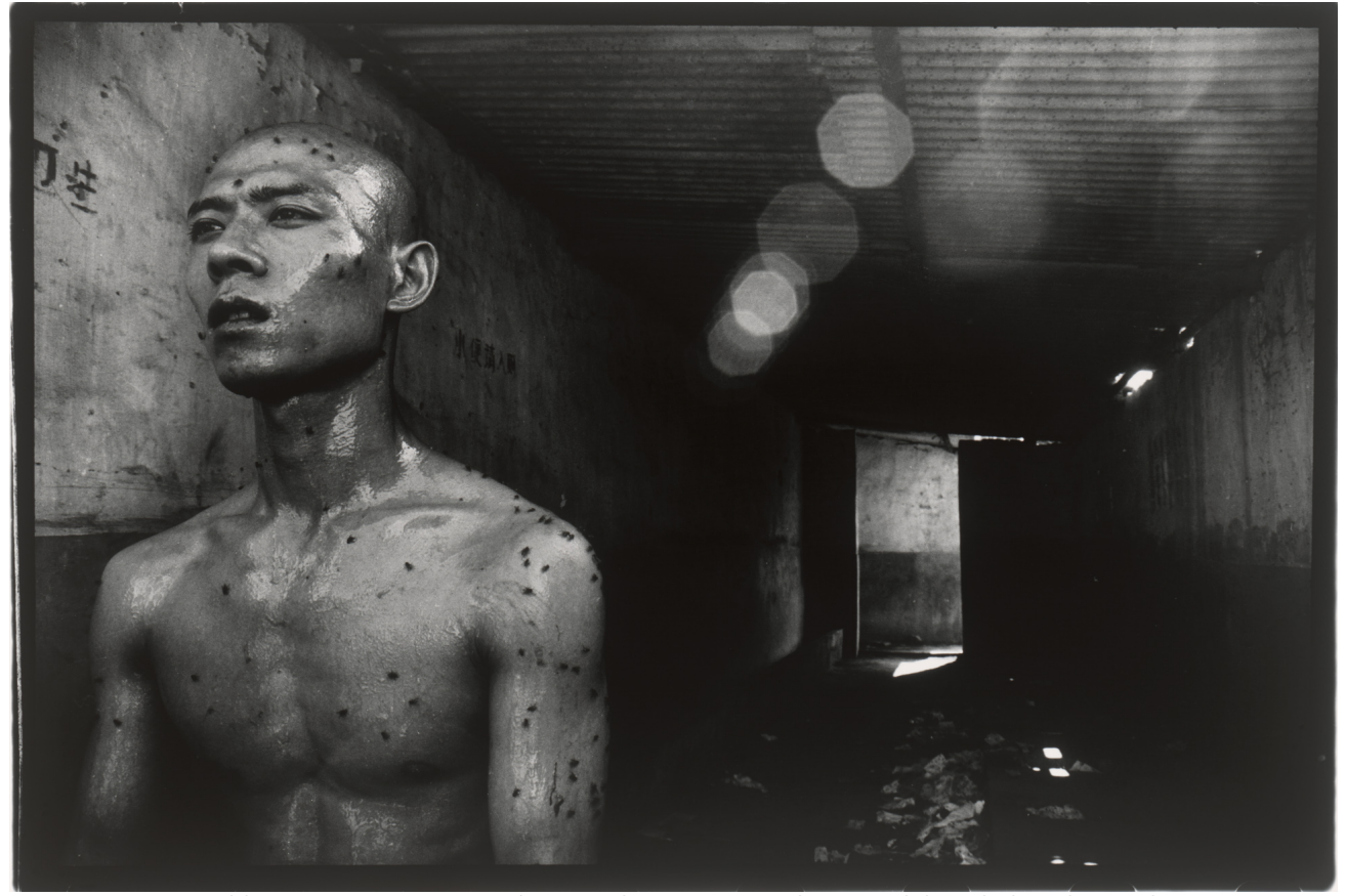
RongRong, 1994 No. 20 (Zhang Huan, "12 Square Meters"), 1994. © The artist. Courtesy the artist and Three Shadows Photography Art Centre, Beijing.

Opening Reception: Thursday, June 13, from 6-8pm